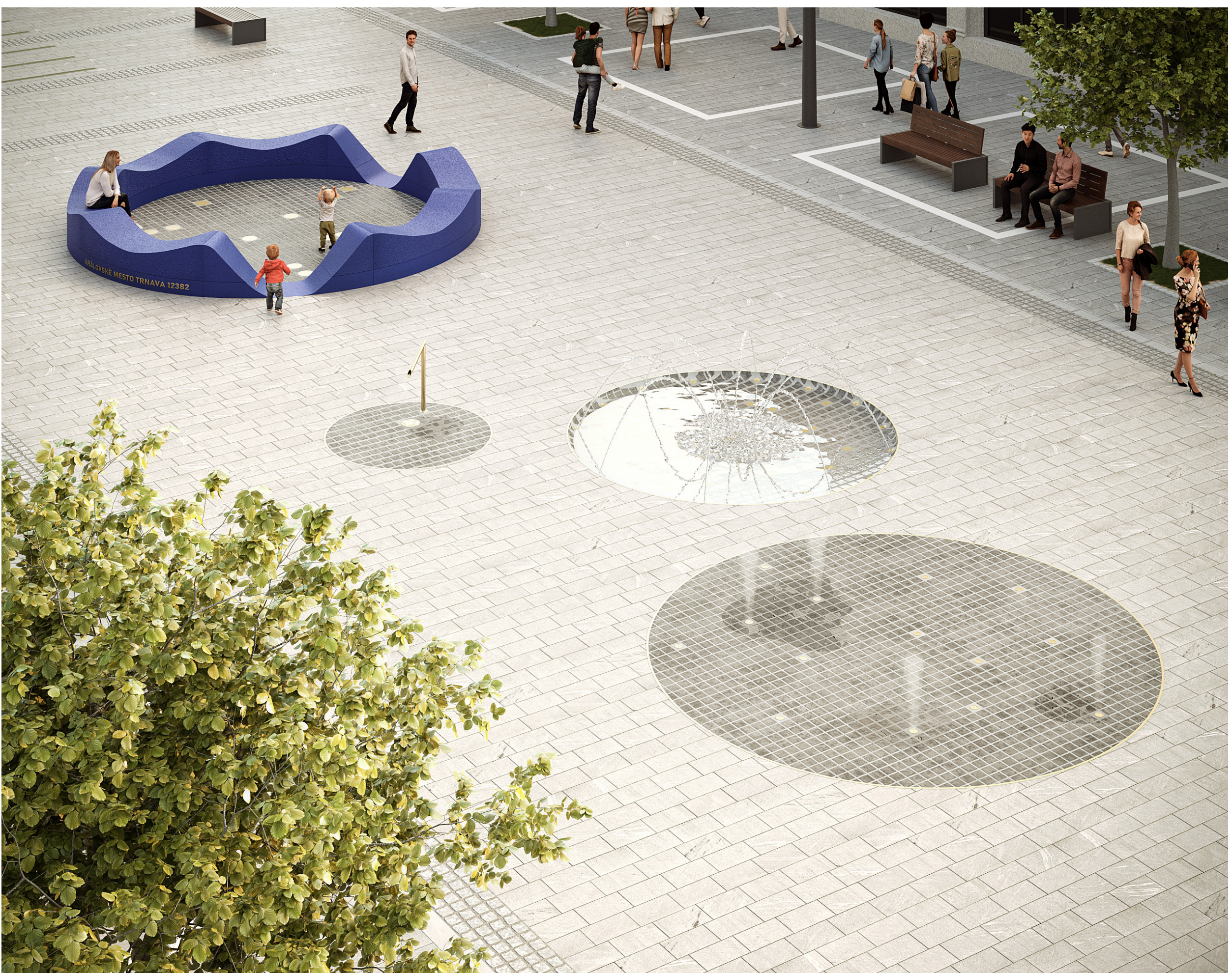
bird's eye view