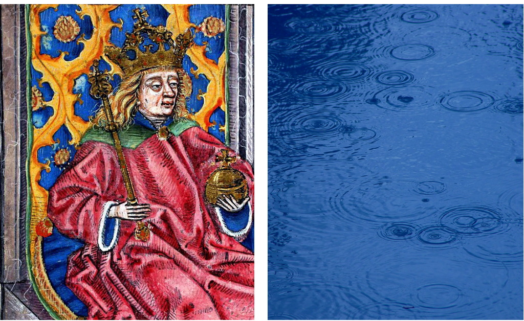
references: Béla IV of Hungary, Thuróczy János, Chronica Hungarorum, 1488. Raindrops on water, Leon Brooks, Photography, 2013.

The project bases its design concept on two main criteria. That of keeping alive the historical reference to which the fountain was dedicated through the abstraction of the symbol of the crown, which is transformed into an emerging, colourful, playful and inclusive element. In addition, an attempt is made to decline the theme of water through three episodes that see it as a protagonist with different meanings. The first in aeriform form, consisting of vertical jets, with the aim of cooling the square during the hot season through a rarefied atmosphere with a low use of water. The second in the form of a mirror, a large circular pool reflecting the sky inside which citizens can also enter and get their feet wet. The third as a drinking fountain, emphasising the importance and public role of this element. Water is used according to a careful thought of a precious resource, to be valued and saved, capable of cooling, quenching thirst, entertaining and making people reflect like a mirror.