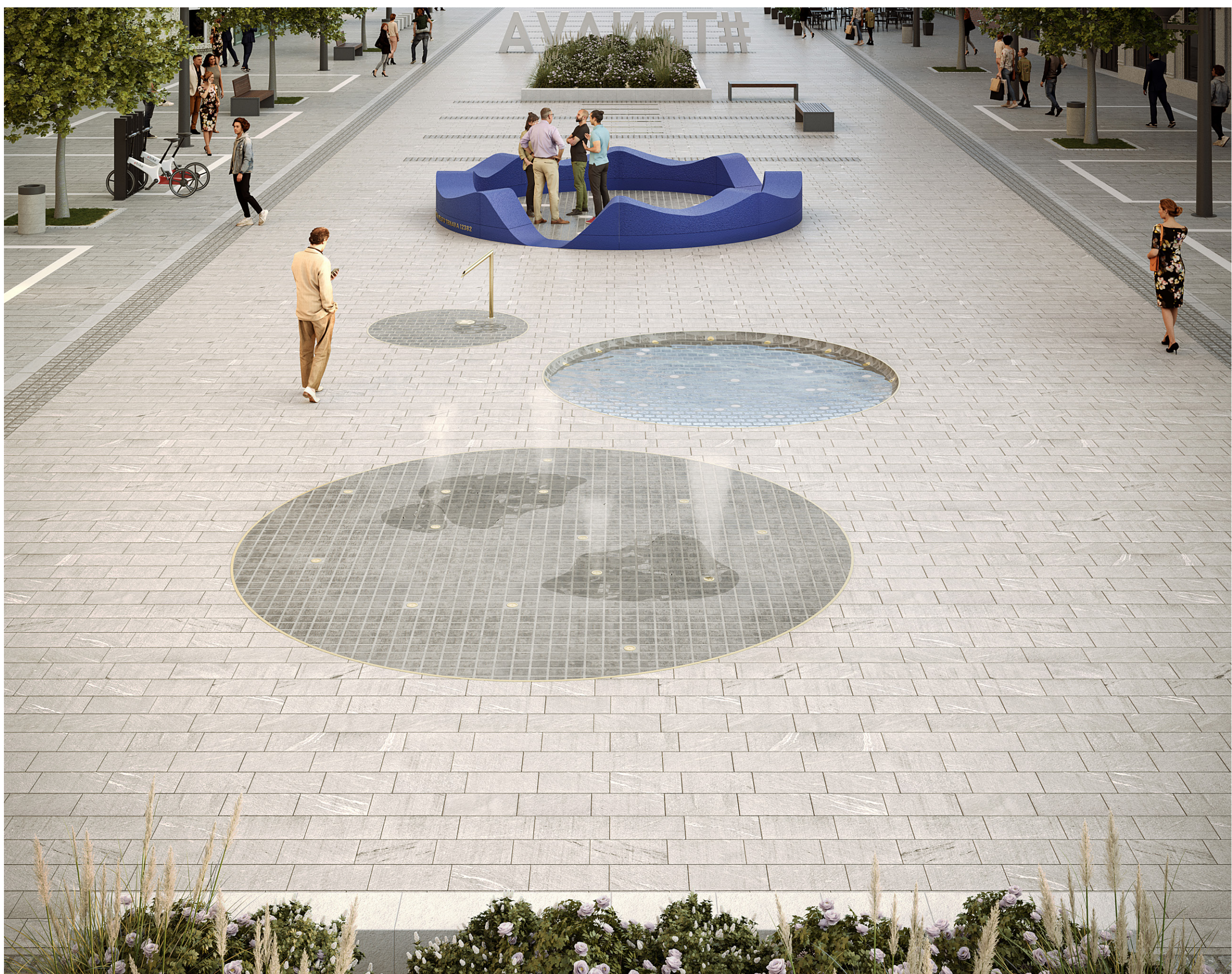
framing of the Hlavná axis