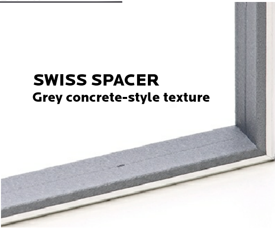
SWISS SPACER Grey concrete-style texture