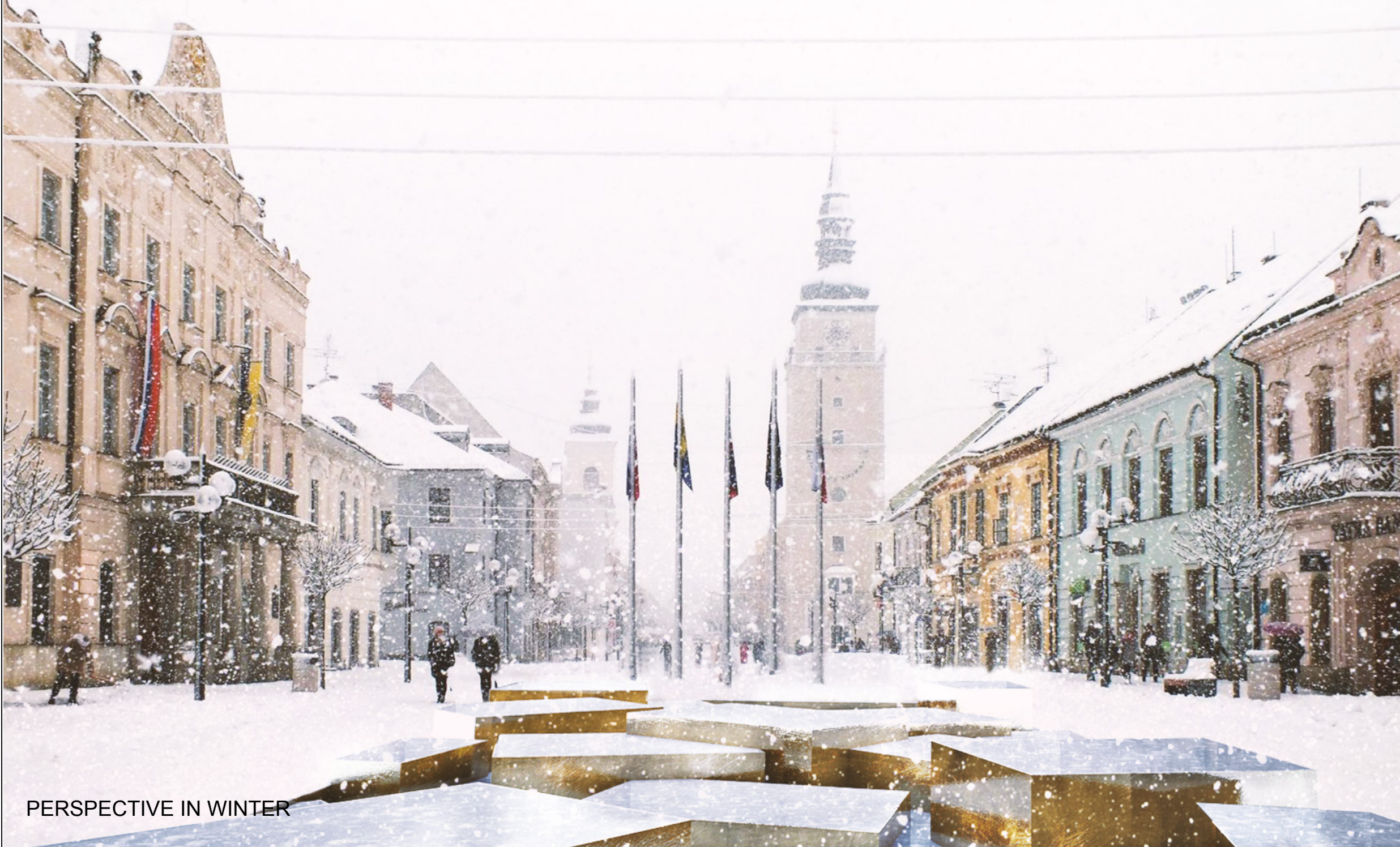
PERSPECTIVE IN WINTER