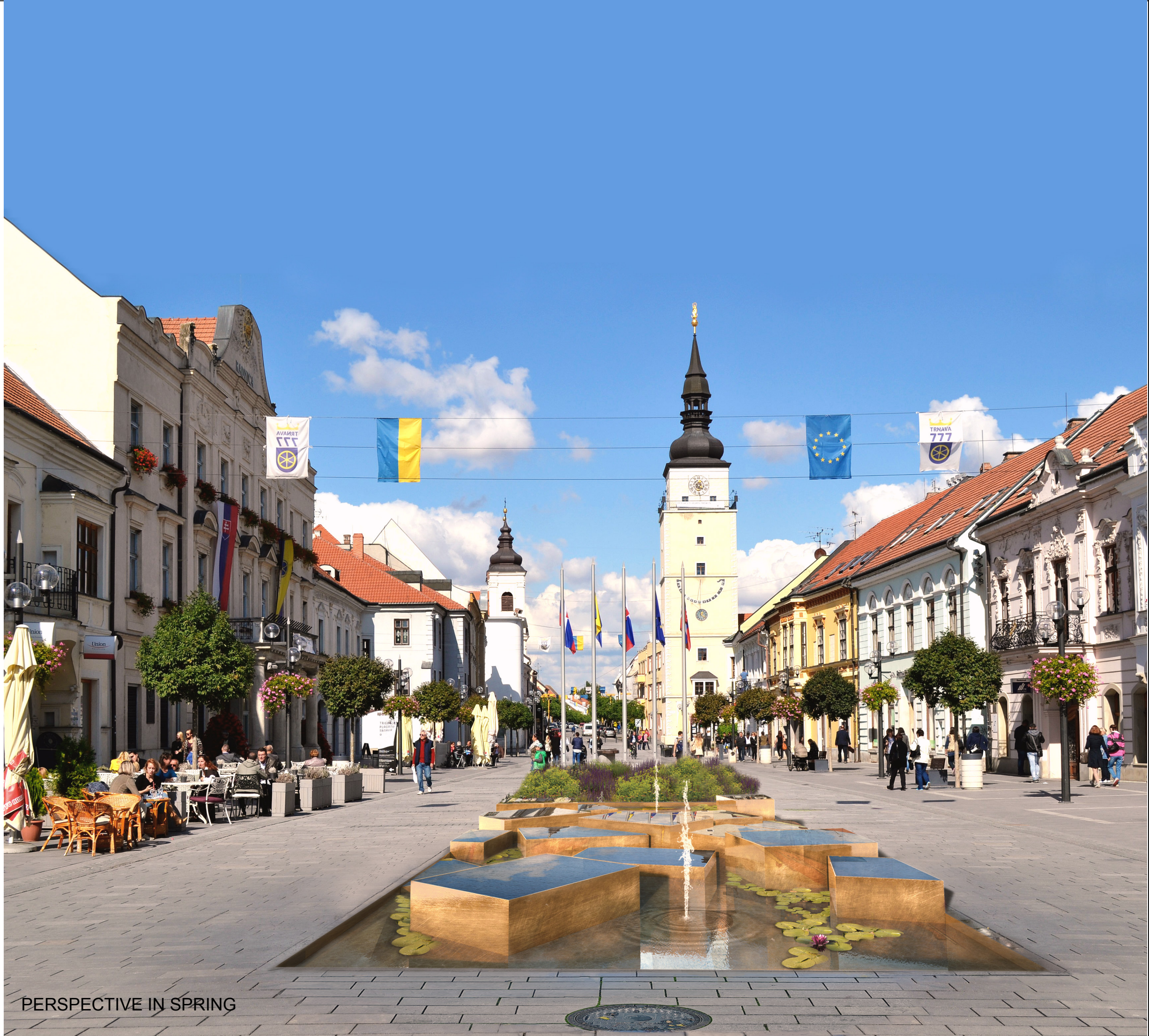
PERSPECTIVE IN SPRING