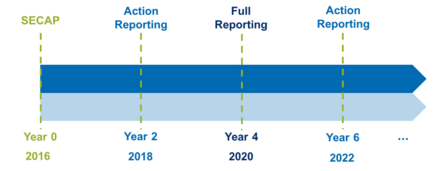
Figure 7. Minimum requirements concerning monitoring

Local authorities committed to starting adaptation actions in their territories have to fill in a Monitoring and Reporting template every second year following the SECAP submission, in order to monitor and outlines the interim results of implemented adaptation measures – and allow corrections to achieve the targets when it is required. Signatories are invited to specify arrangements in place to review current / future climate risks, monitor and evaluate the impact of the adaptation actions.