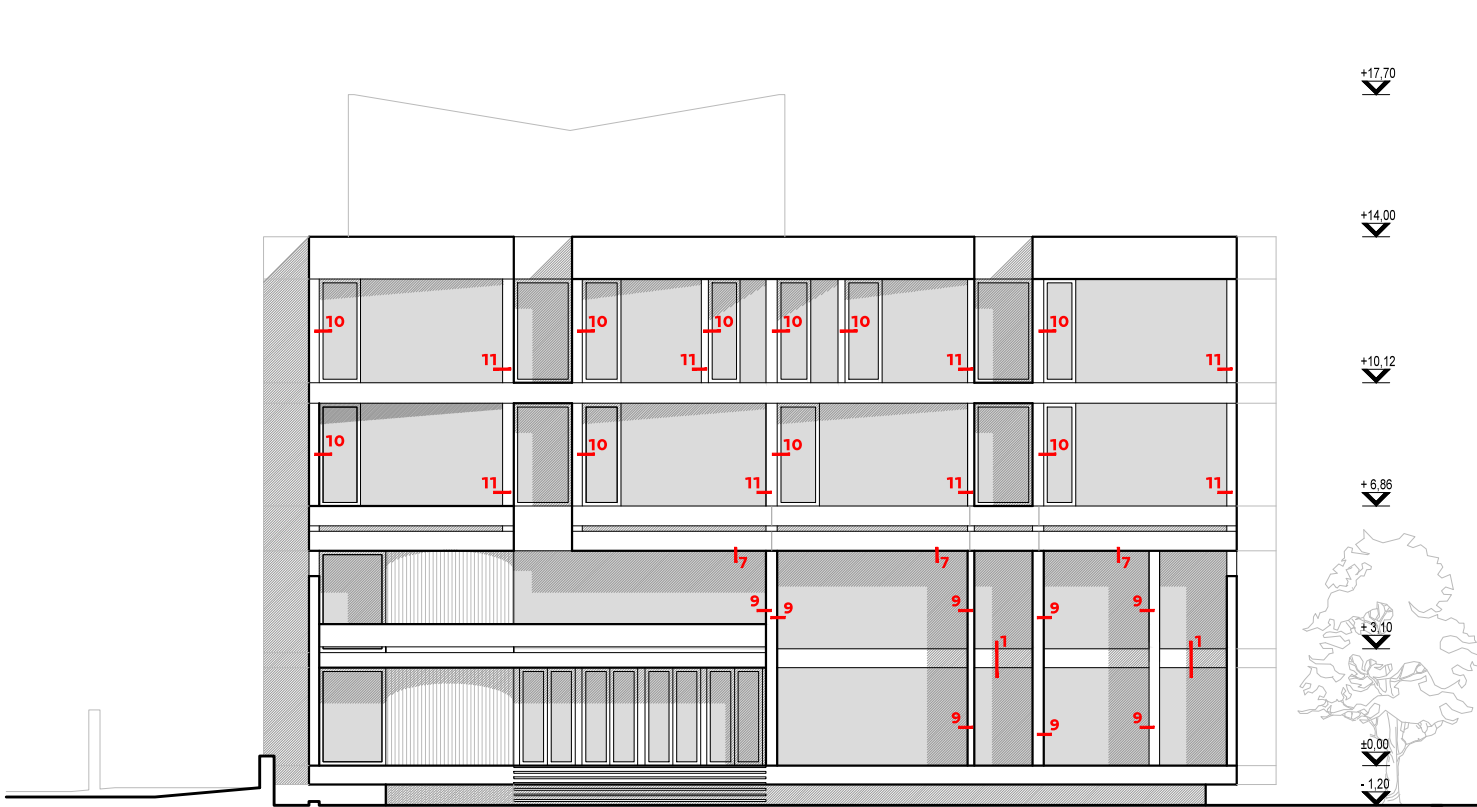
EAST ELEVATION SCALE 1:200