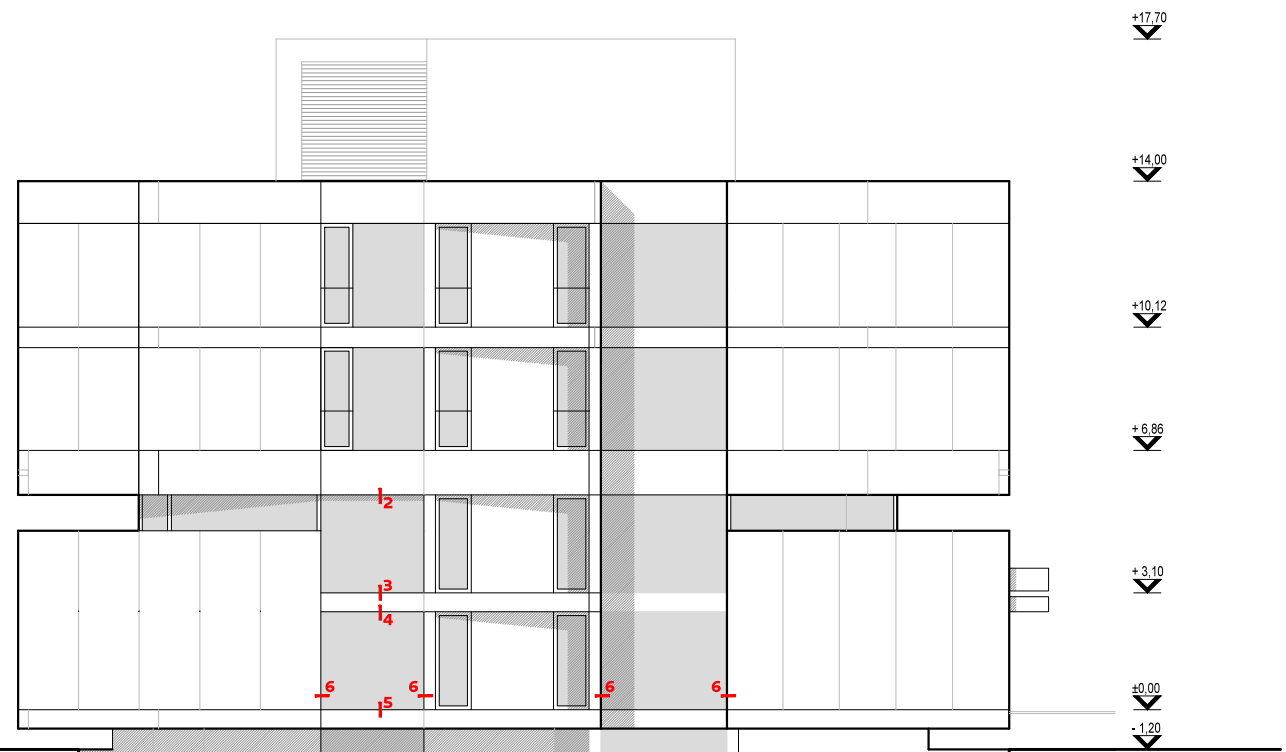
SOUTH ELEVATION SCALE 1:200